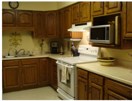
Kitchen/Dining Room – 15'3" x 12'9"