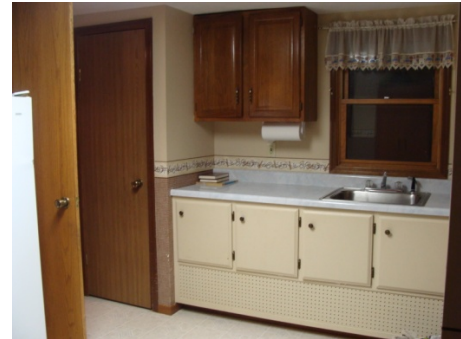
Utility Room – 11'8" x 13'2"