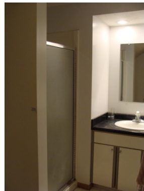
Bath – 10'2" x 5'6"