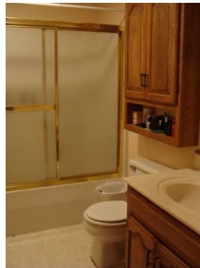
Bath – 5'10" x 13'3"