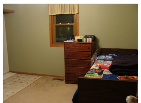
Bedroom – 11'10" x 15'2"