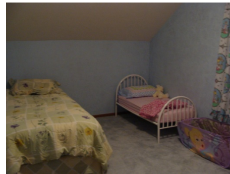
Bedroom – 14' x 10'