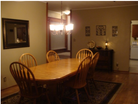
Dining Room – 14'11" x 22'4"