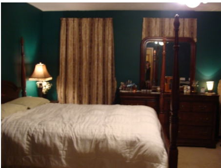
Master Bdrm – 15'11" x 14'10"