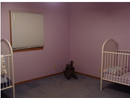
Bedroom – 11' x 14'